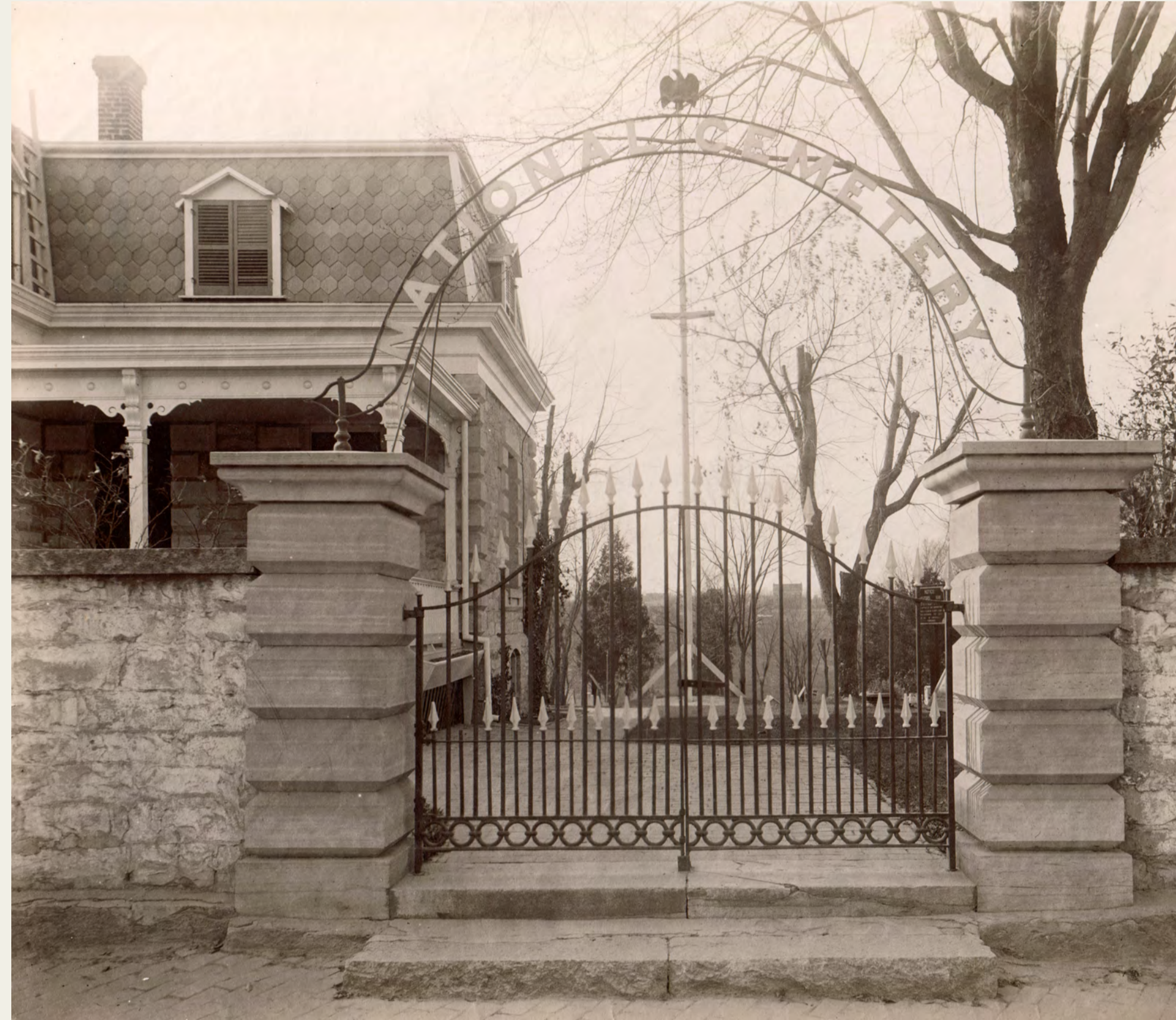
Entrance gate and lodge, 1903.