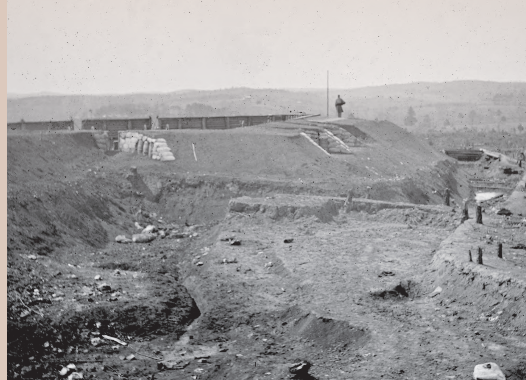
Fort Sanders, c. 1863. Surrounded by a ditch 8 feet deep, the fort was located near Clinch Avenue just north of what is today the University of Tennessee campus.

Longstreet attacked at Fort Sanders on the western edge of the Union line on November 29. The assault lasted less than an hour as Union soldiers inflicted heavy losses on Confederate troops. The Confederates retreated and attempted to lay siege to the city. Longstreet withdrew in December, leaving East Tennessee firmly in Union hands.