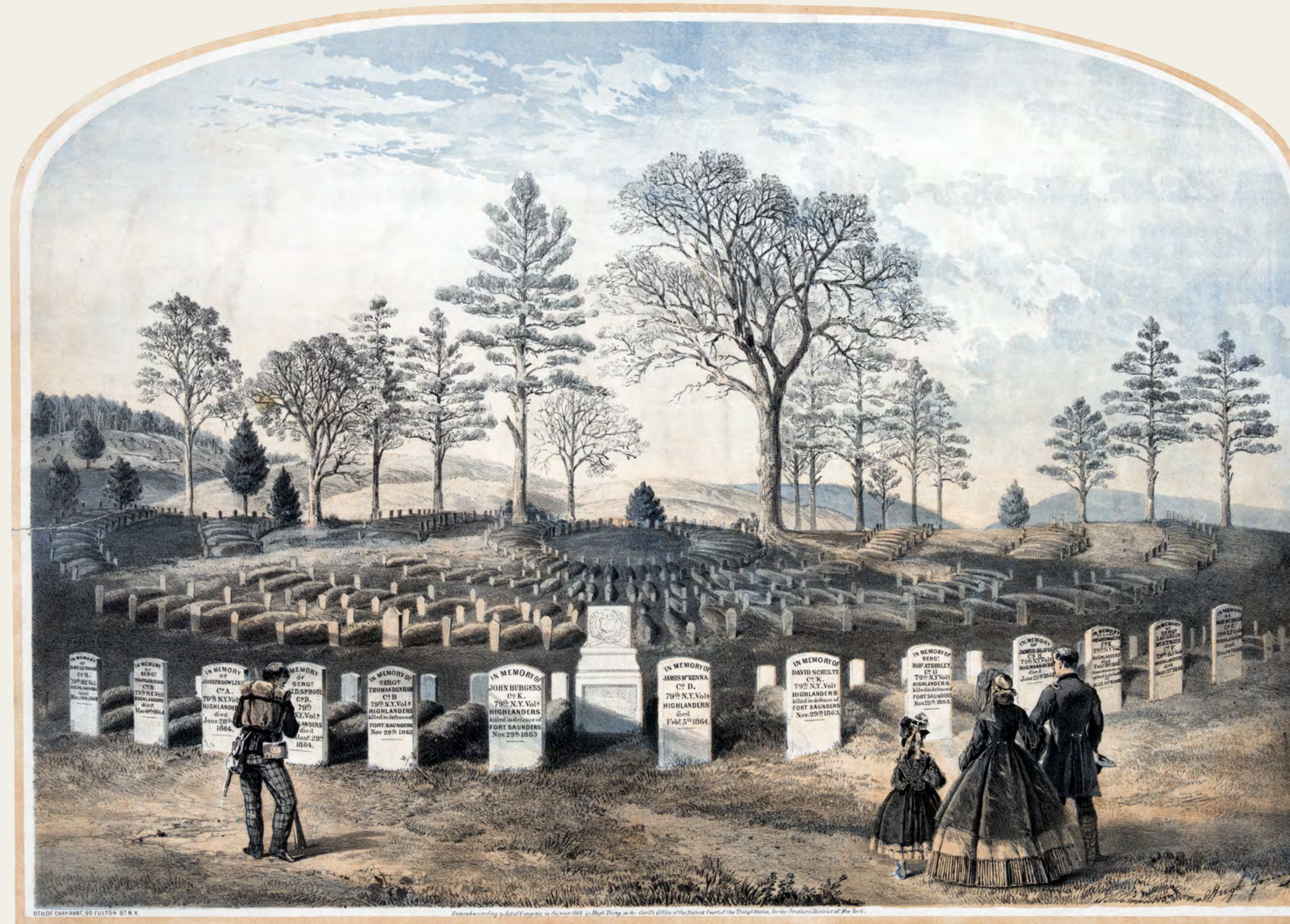
Lithograph of cemetery, 1864, that emphasizes the Highlander Monument and headstones in Section A.