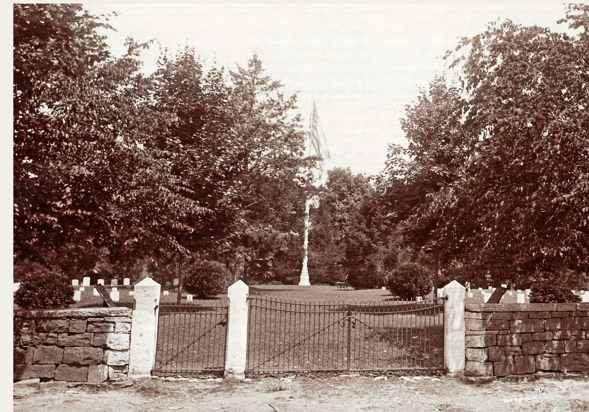
Cemetery entrance, 1904.