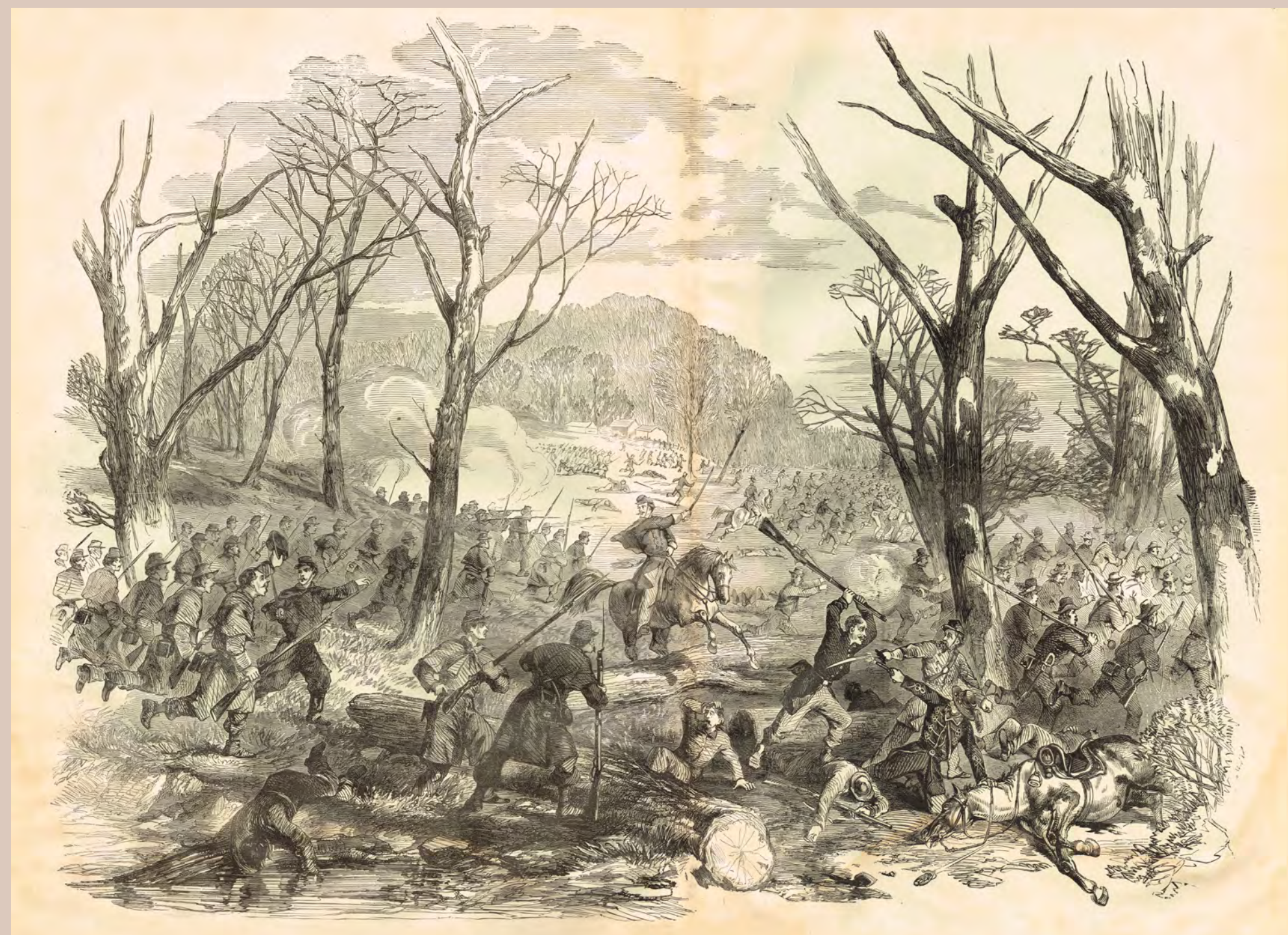
Battle of Mill Springs, January 19, 1862. Our Soldier in the Civil War (1886).