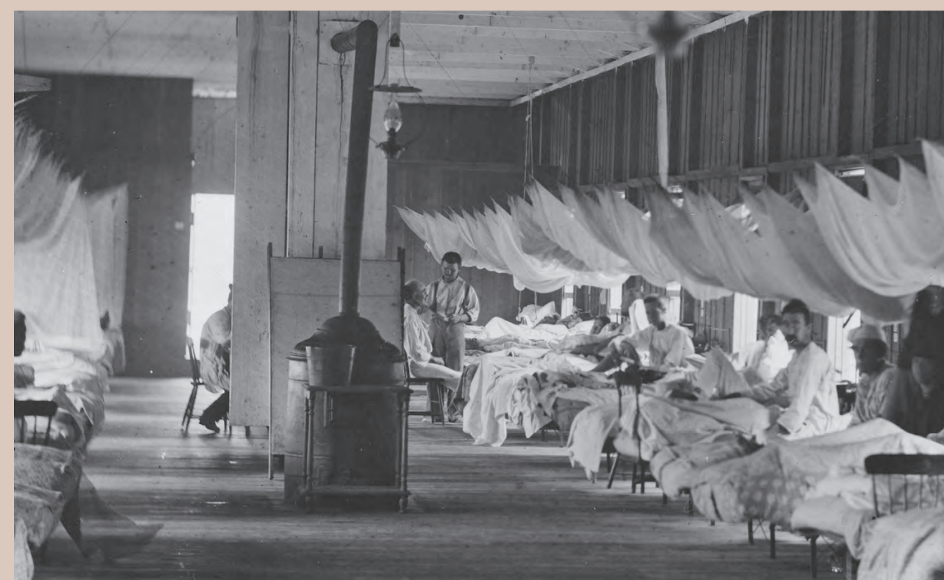
This ward at a Washington, D.C., hospital was typical of those where Union soldiers were treated during the Civil War.

Over the course of the Civil War, more than 157,000 soldiers, sailors, and Confederate prisoners were treated in Philadelphia hospitals. Many died from disease or their wounds and were buried in nearby cemeteries.