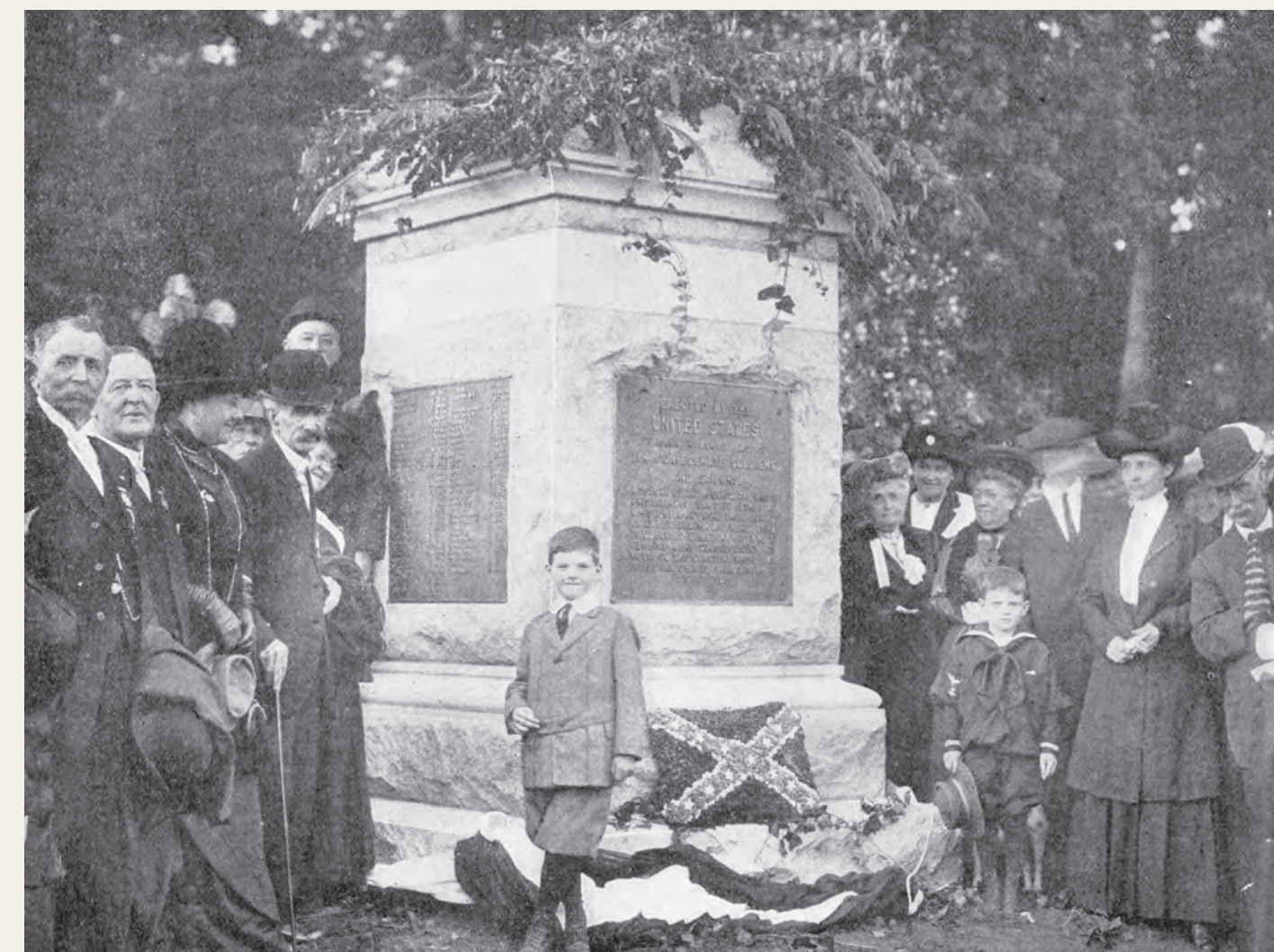
The monument dedication, 1911. Confederate Veteran, December 1911.

The Commission for Marking Graves of Confederate Dead began documenting burials in July 1906. No one was able to explain to the Commission how the UDC arrived at the number of 224 unknown listed on the tablet. Few records accompanied the burials moved from Rural Cemetery, which had the greatest number of Confederate burials in the area. Many records were incomplete and documentation of remains removed to other states was contradictory. The Commission agreed that graves could not be matched with individuals.