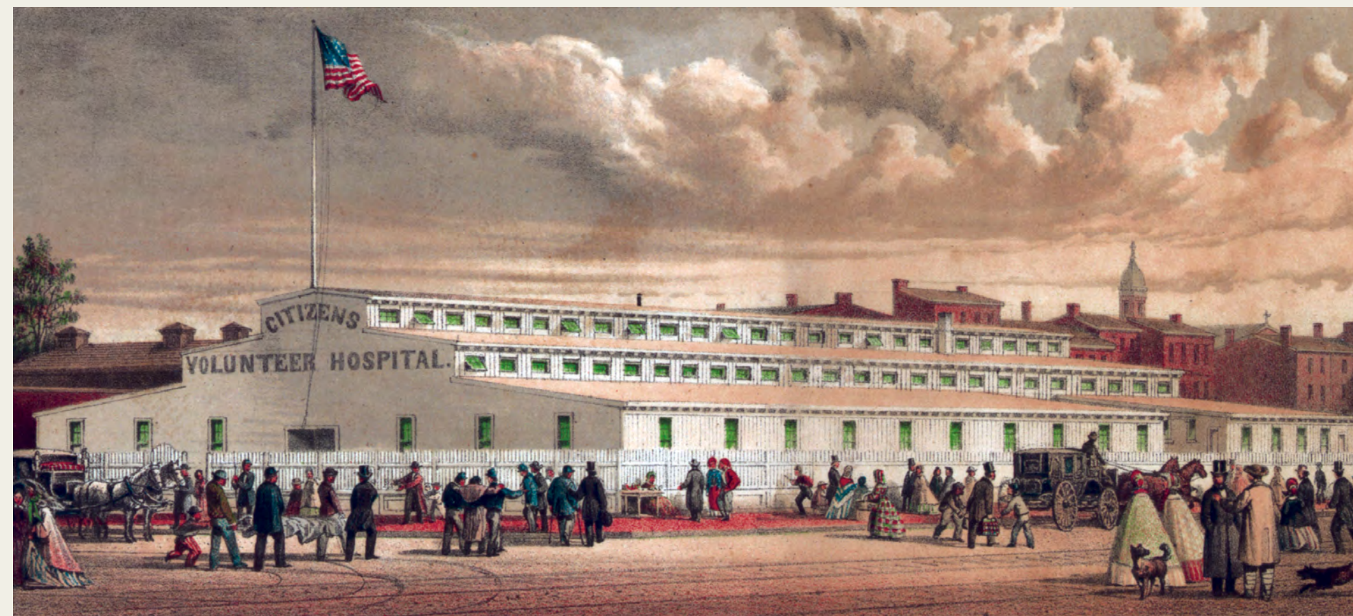
Citizens Volunteer Hospital in Philadelphia was one of many facilities where Confederate prisoners captured at Gettysburg were treated, c. 1865.