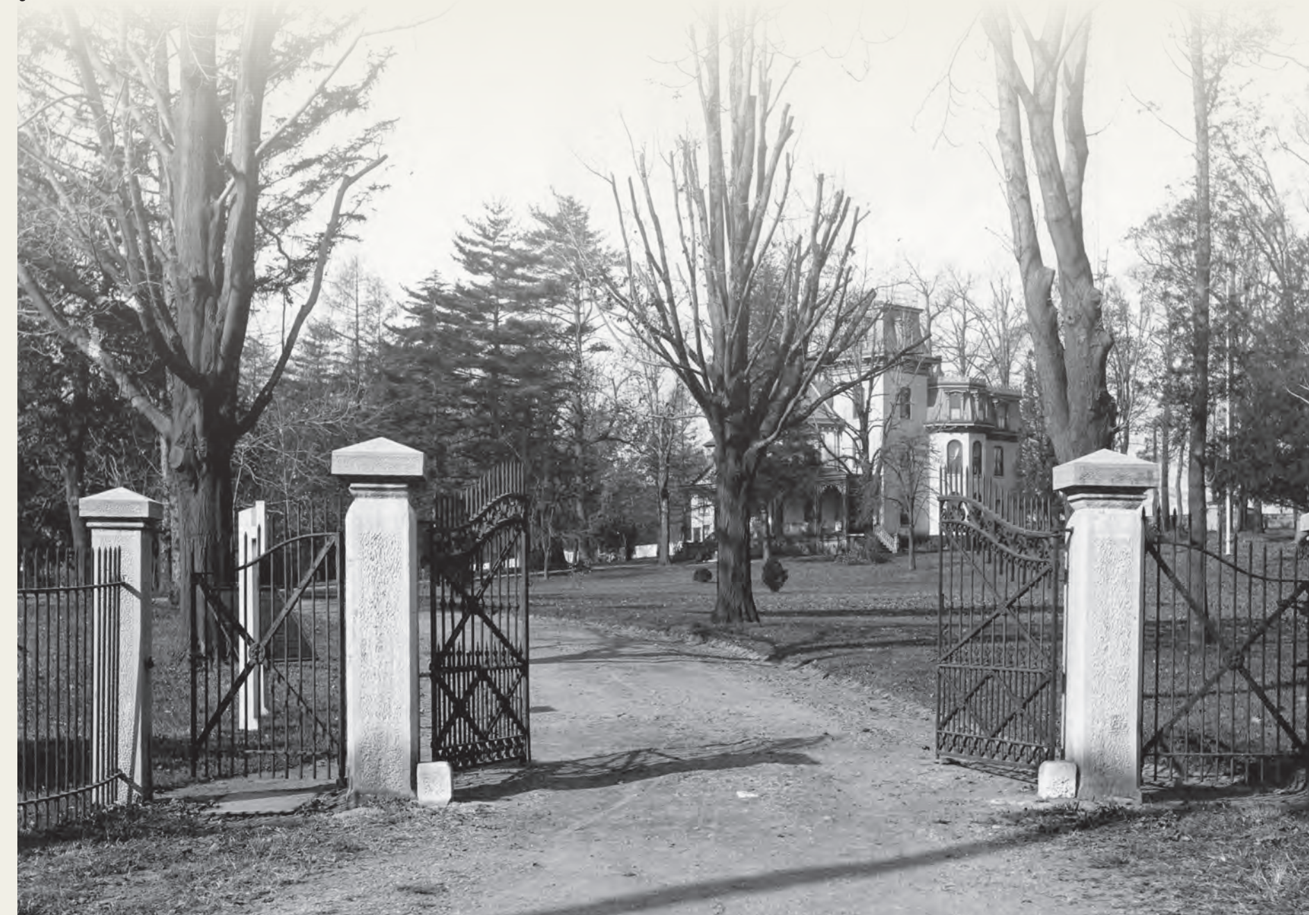
View of cemetery with lodge, 1903; the gate was replaced in 1940. National Archives and Records Administration.

The cemetery was designed in the rural style. Curving roads and generous plantings created a park-like environment. A large Italianate house acquired with the property served as the superintendent's residence for fifty years. It was razed in 1934.