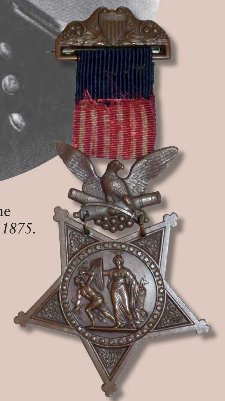
Civil War Army Medal of Honor. Gettysburg National Military Park.