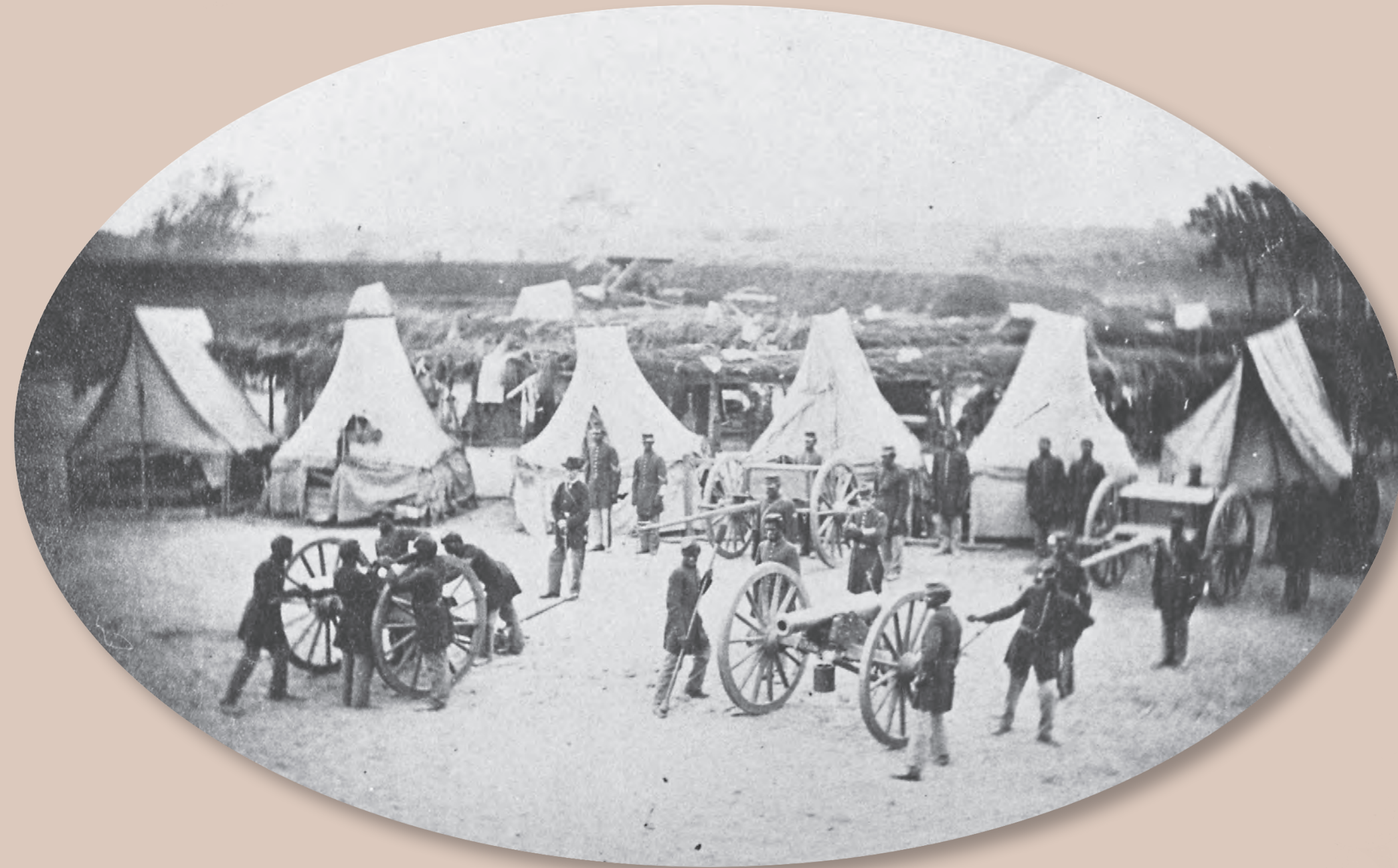
The 1st and 3rd Louisiana Native Guards drill near Port Hudson in 1863.