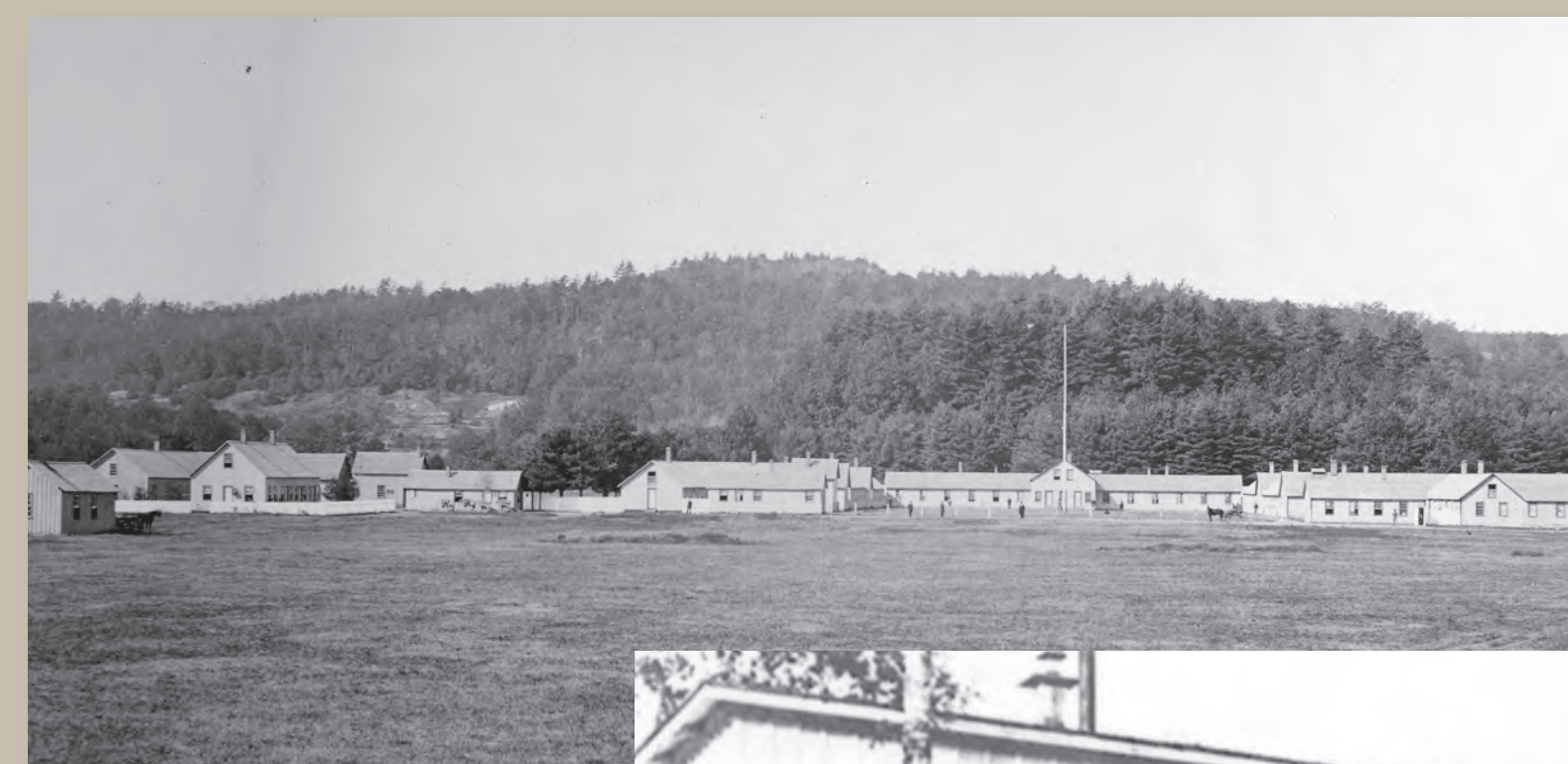
Top: Undated photograph of U.S. General Hospital. Right: Union soldiers outside of a supply hut at the hospital, 1864.