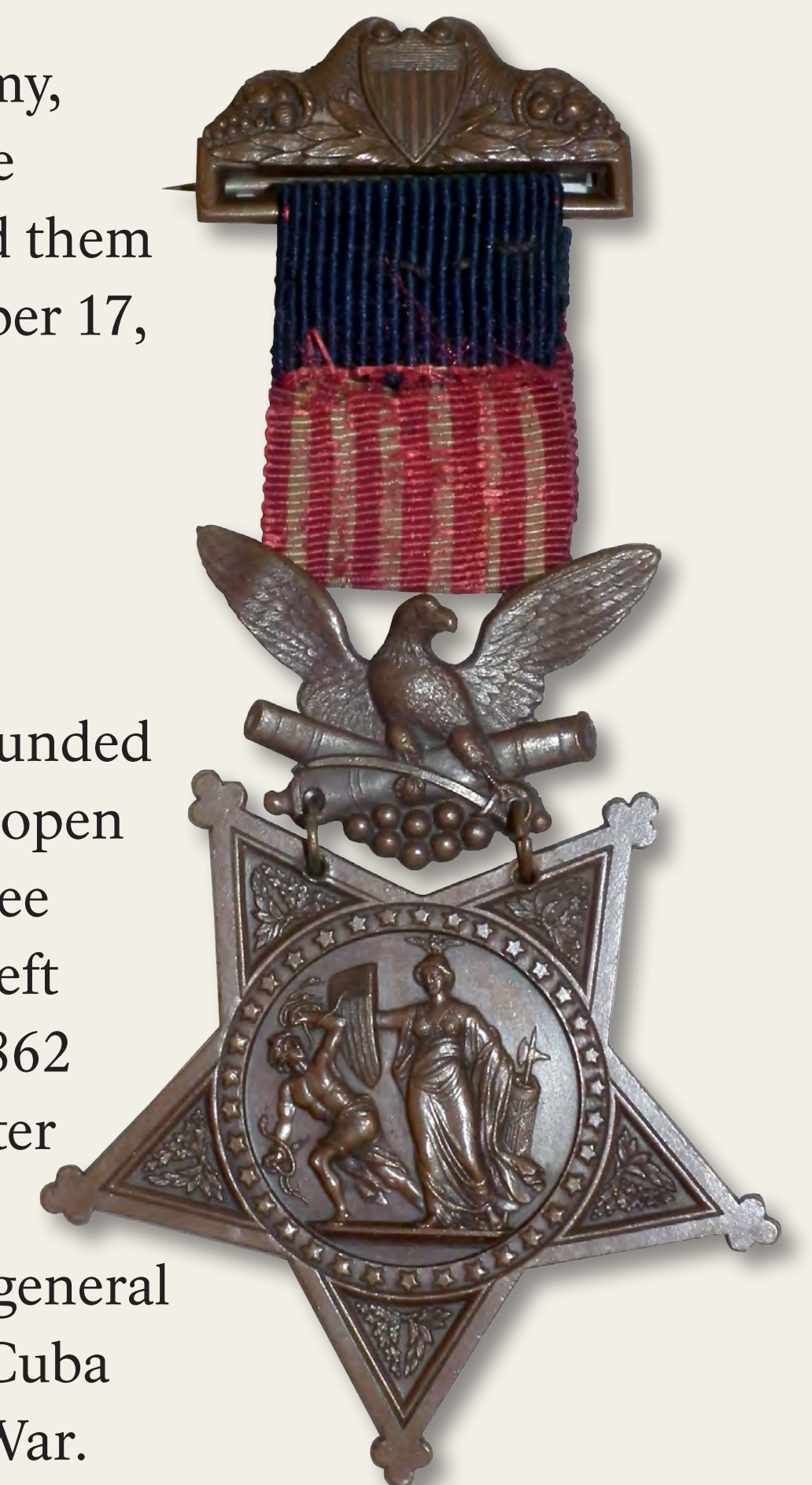
Civil War Army Medal of Honor. Gettysburg National Military Park.

First Lt. William Rufus Shafter, 7th Michigan Infantry, was wounded when he led a charge across an open field. He hid his injuries for three days until other wounded had left Fair Oaks, Virginia, May 31, 1862 (Section OS, Grave 30-3). Shafter later joined the Regular Army. He was promoted to brigadier general in May 1898 and led troops in Cuba during the Spanish-American War.