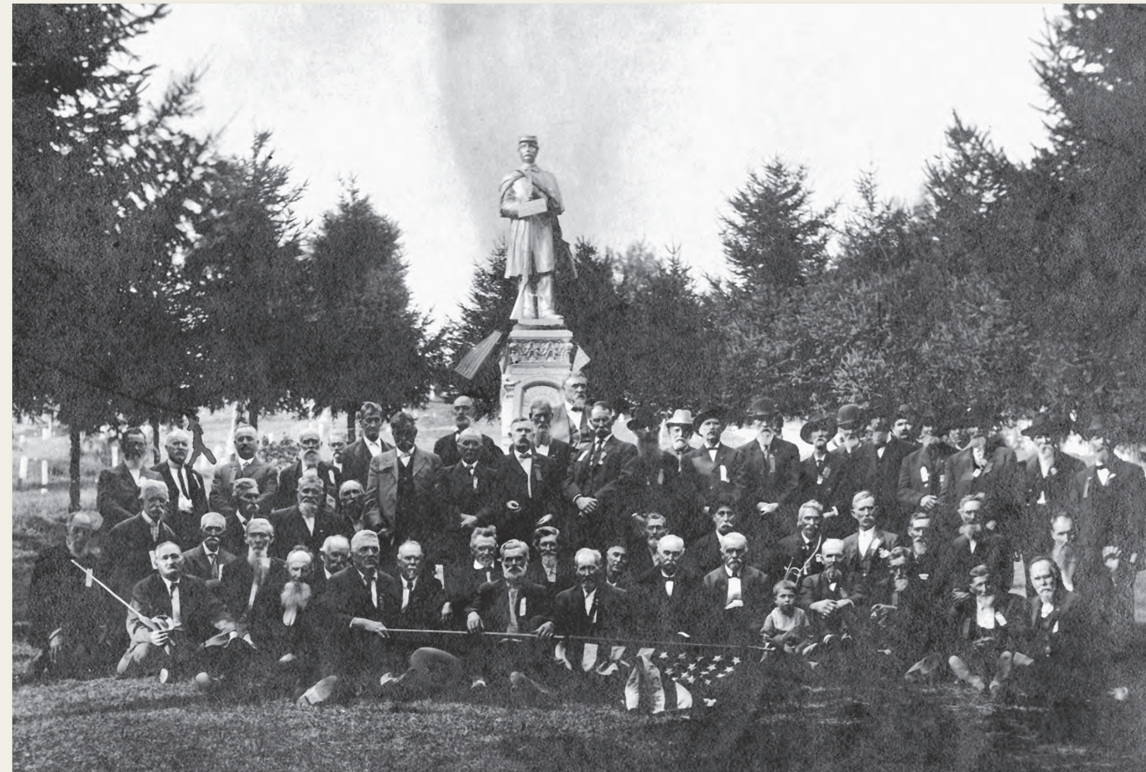
Unidentified veterans at the Pacific Coast Garrisons Monument, c. 1897.