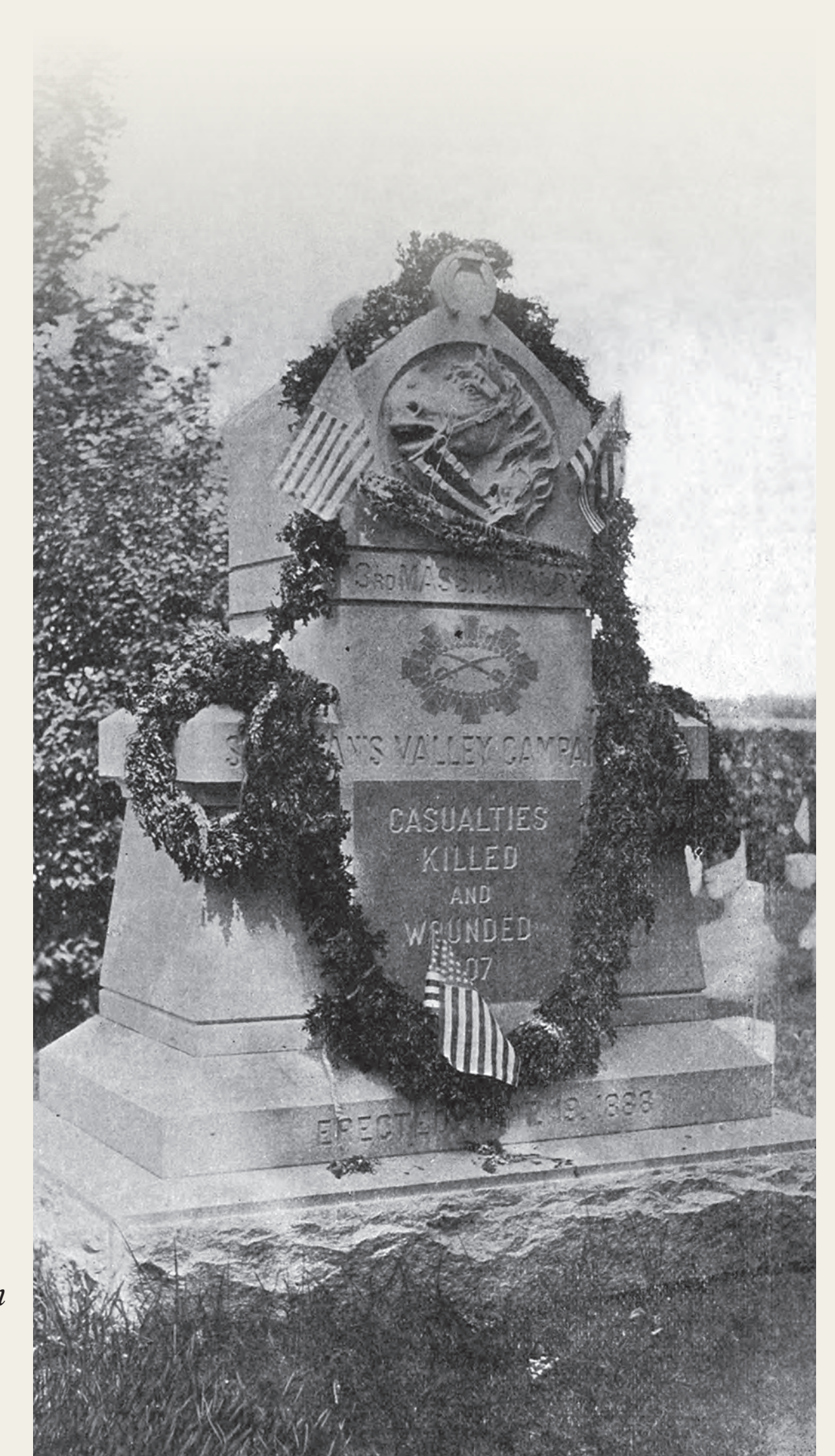
Monument to the 3rd Massachusetts Cavalry, c. 1888. Four of the fourteen monuments in the cemetery honor Massachusetts soldiers. The Third Massachusetts Cavalry in the War for the Union, 1903.