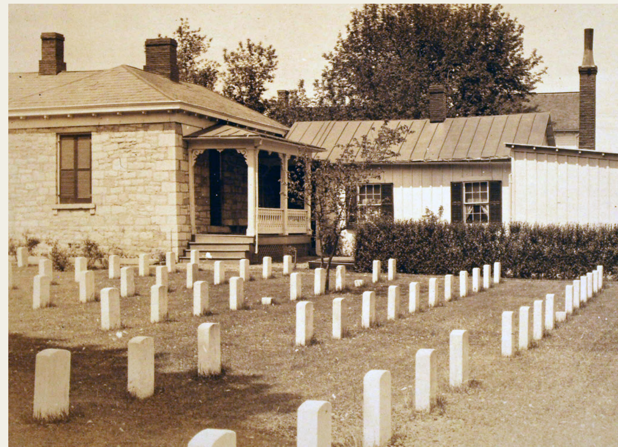
The 1871 superintendent’s lodge before a second story was added, c. 1905.

Though approximately half of the 4,440 remains buried here were unknown, when possible they were placed in sections designated for particular states.