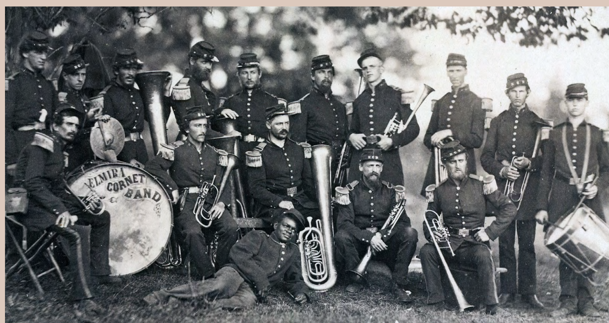
The 8th New York Militia band, some of the 20,000 men who mustered in at Elmira, c. 1861.

Located on two railroad lines and a canal, Elmira was the perfect rendezvous point for enlistees from upstate New York. Between 1861 and 1863, more than 20,000 men passed through the city on their way to the front. All three units of the army—infantry, artillery, and cavalry—were mustered in and trained at Elmira.