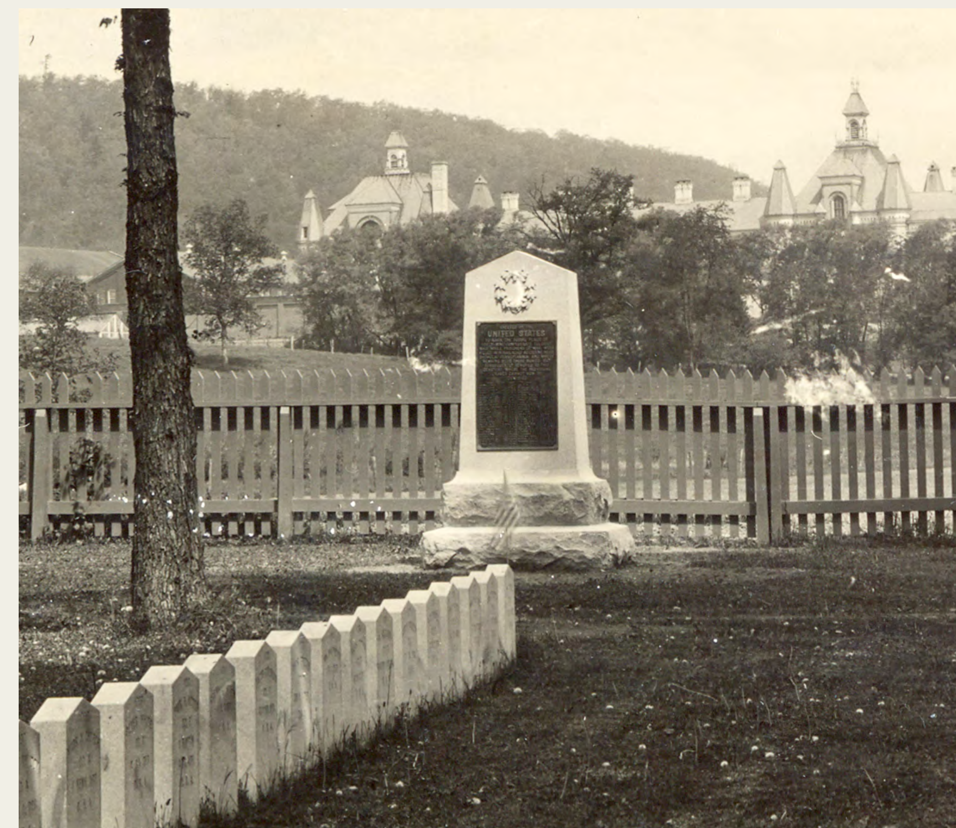
Shohola Monument, 1912.