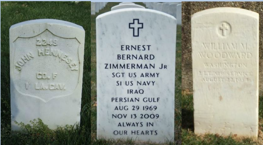
Figure 4: Left: Upright marble headstone, Middle: Headstone with lithograph, Right: Headstone without Lithograph