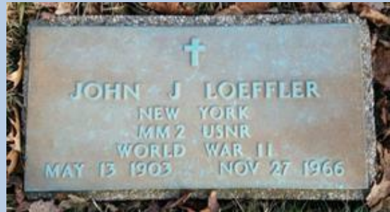
Figure 2: Older Marker with acceptable Patina.