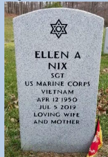
Figure 5: Upright Granite Headstone (with lithograph)