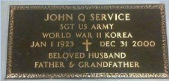
Figure 1: Bronze Flat Marker