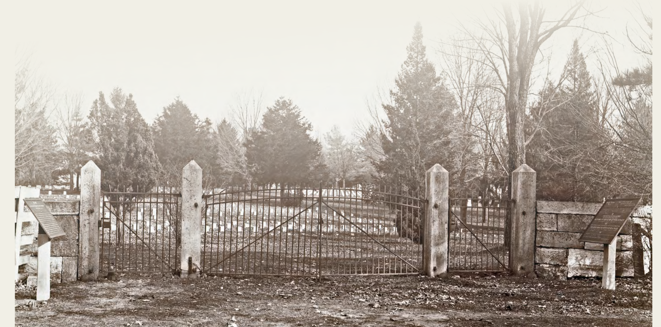
Cemetery gate, 1904. The cast-iron plaques contain information about the establishment of the national cemeteries (left) and the rules of behavior for visitors (right).

Prior to 1869, ten federally established or public cemeteries in Kentucky contained the remains of Union soldiers. The work of reintering the dead was almost complete when the army changed its plan and reduced the number of cemeteries in the state to six.