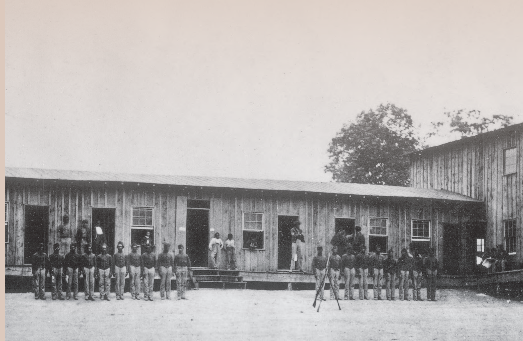
U.S. Colored Troops barracks at Camp Nelson, c. 1865.