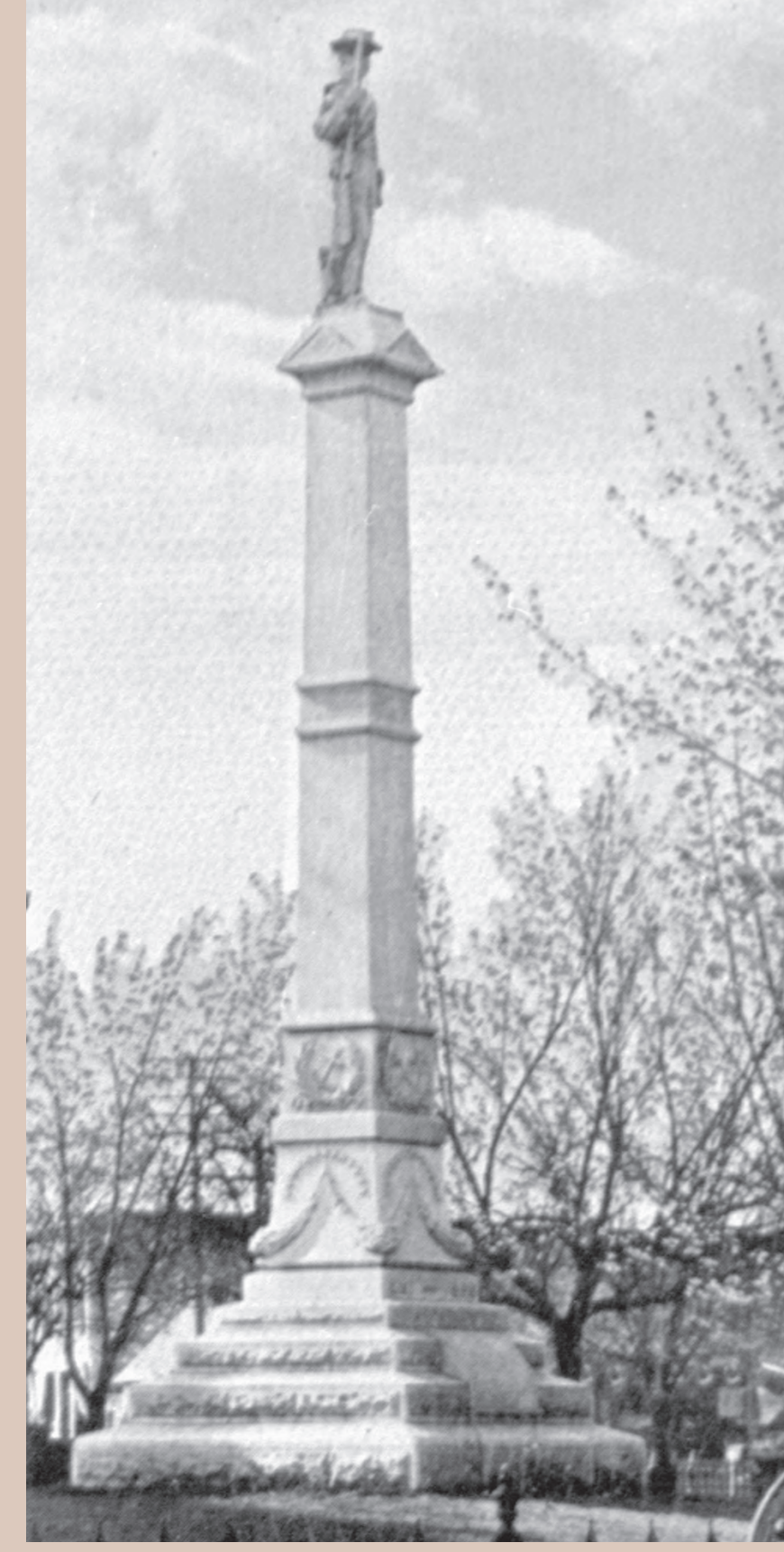
The Fort Smith Confederate Monument on the courthouse lawn, 1960.

The United Confederate Veterans and the United Daughters of the Confederacy raised money to replace the monument, and in 1901 they submitted the design to the War Department. The design was rejected because the inscription violated government policy that text be "without praise and without censure." The proposed monument was eventually erected on the Sebastian County courthouse lawn, where it stands today. About 1904, the War Department replaced the destroyed monument with a small marble obelisk.