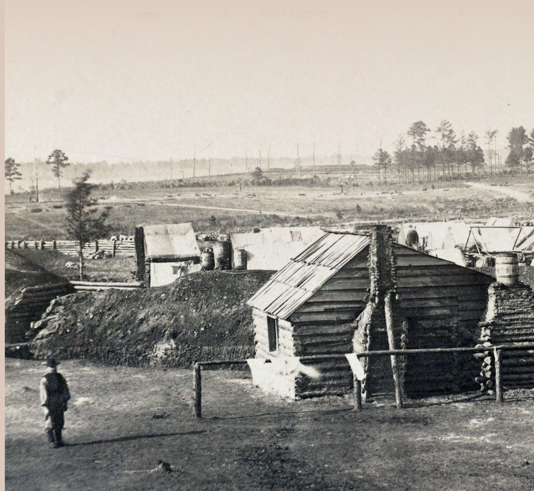
Fort Harrison after its capture on September 29, 1864.