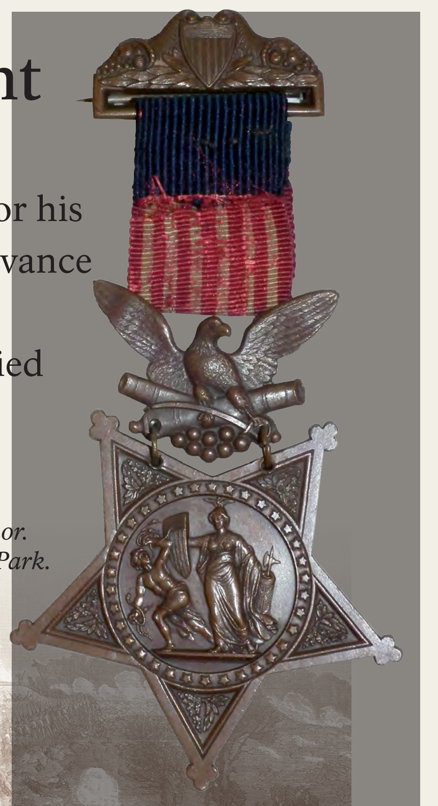
Civil War Army Medal of Honor. Gettysburg National Military Park.