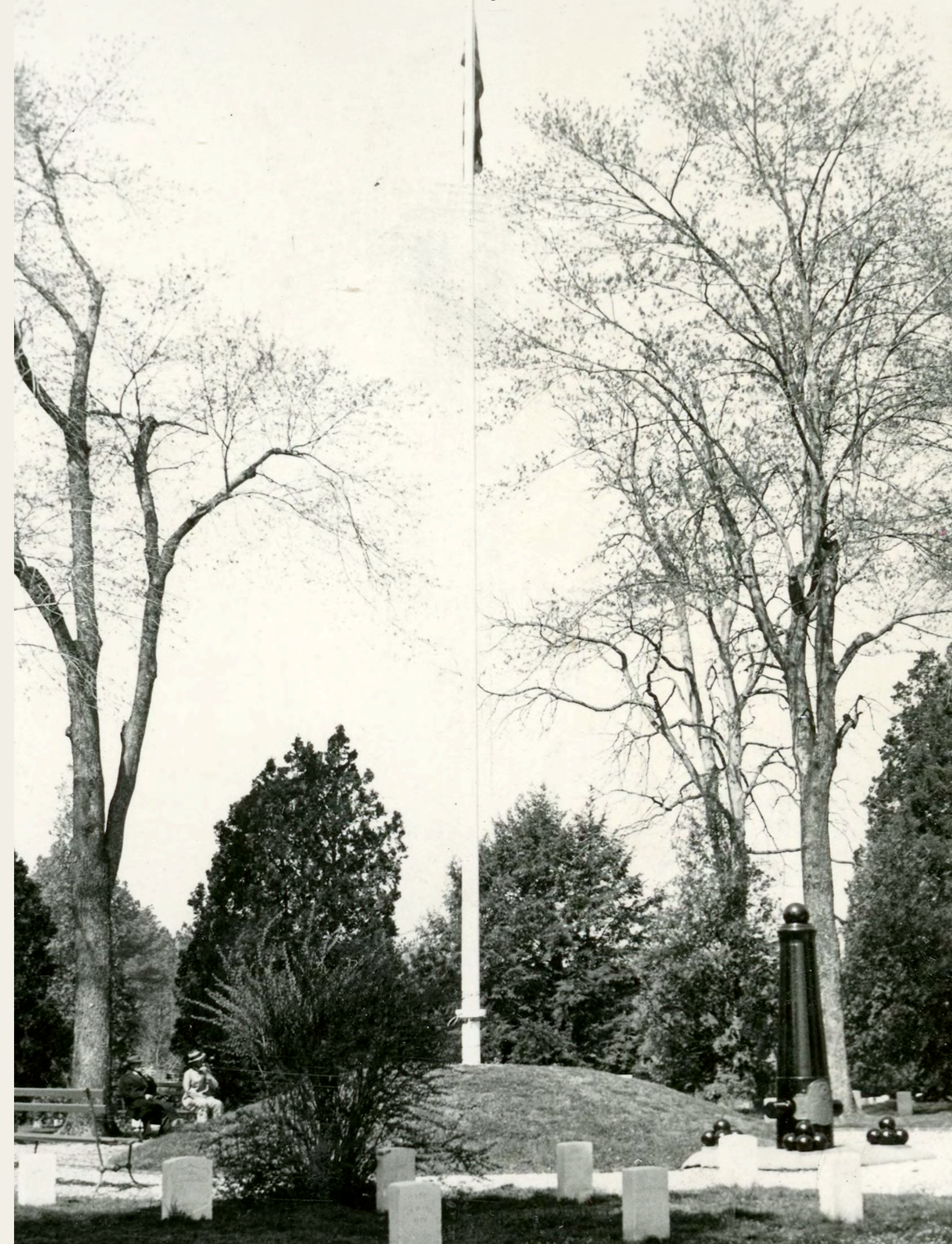
The flagstaff and artillery monument c. 1940.

During the Civil War, thousands of Union soldiers perished in battles fought for control of Richmond. They are now buried in Fort Harrison National Cemetery and six other national cemeteries established in the Richmond-Petersburg area in 1866. When the cemetery was established in May, it contained the remains of 814 soldiers—more than half were unknown.