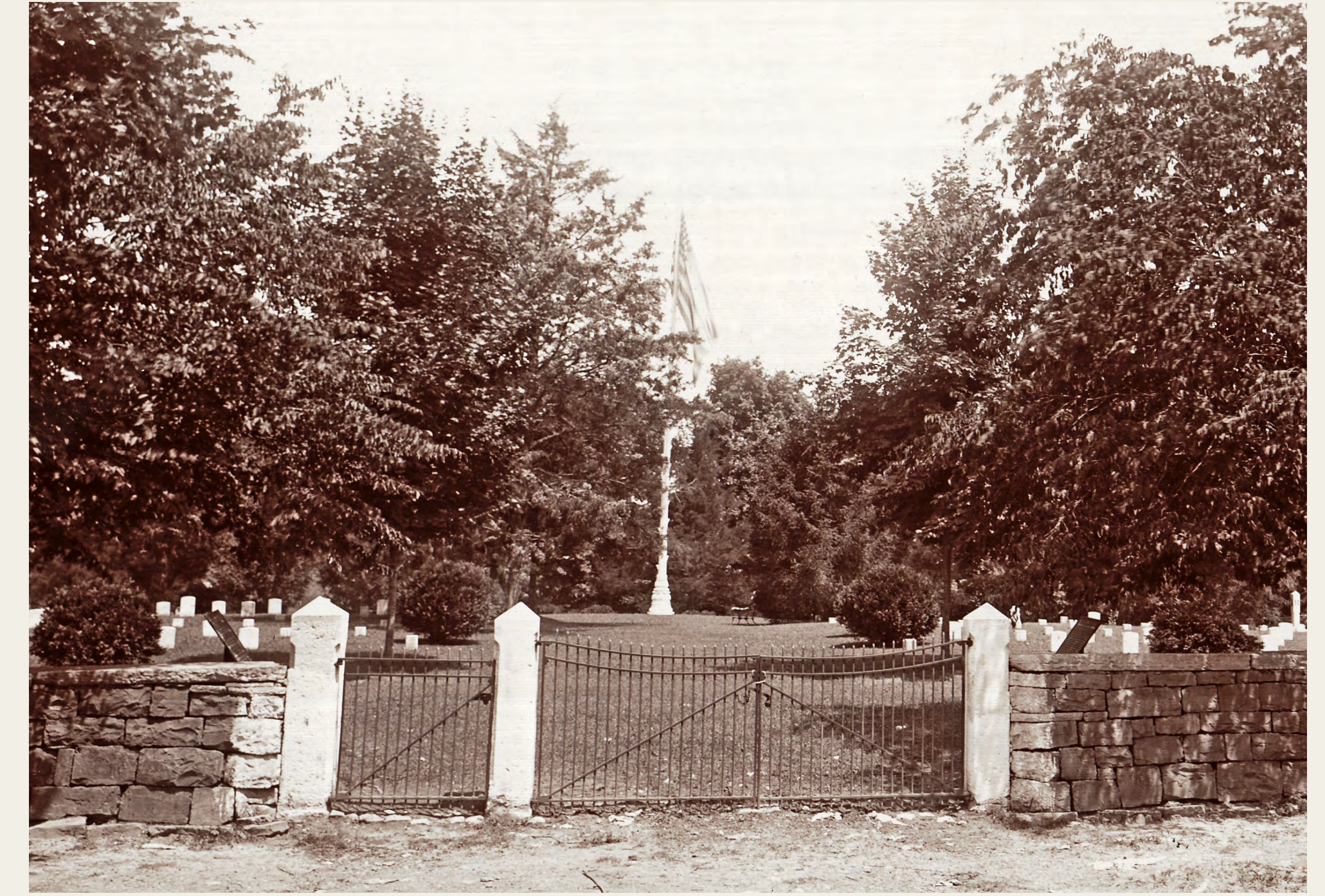
Cemetery entrance, 1904.