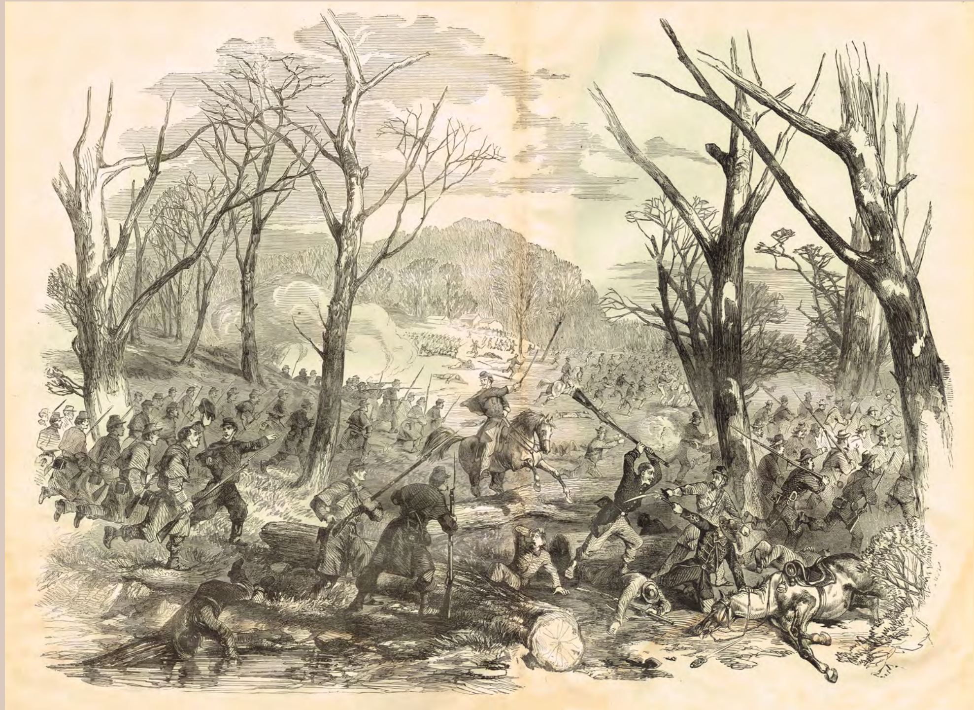
Battle of Mill Springs, January 19, 1862. Our Soldier in the Civil War (1886).