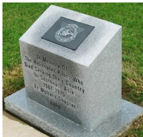
Monuments to Vietnam-era service at Calverton National Cemetery, NY, (top) and Dallas-Fort Worth National Cemetery, TX (below).