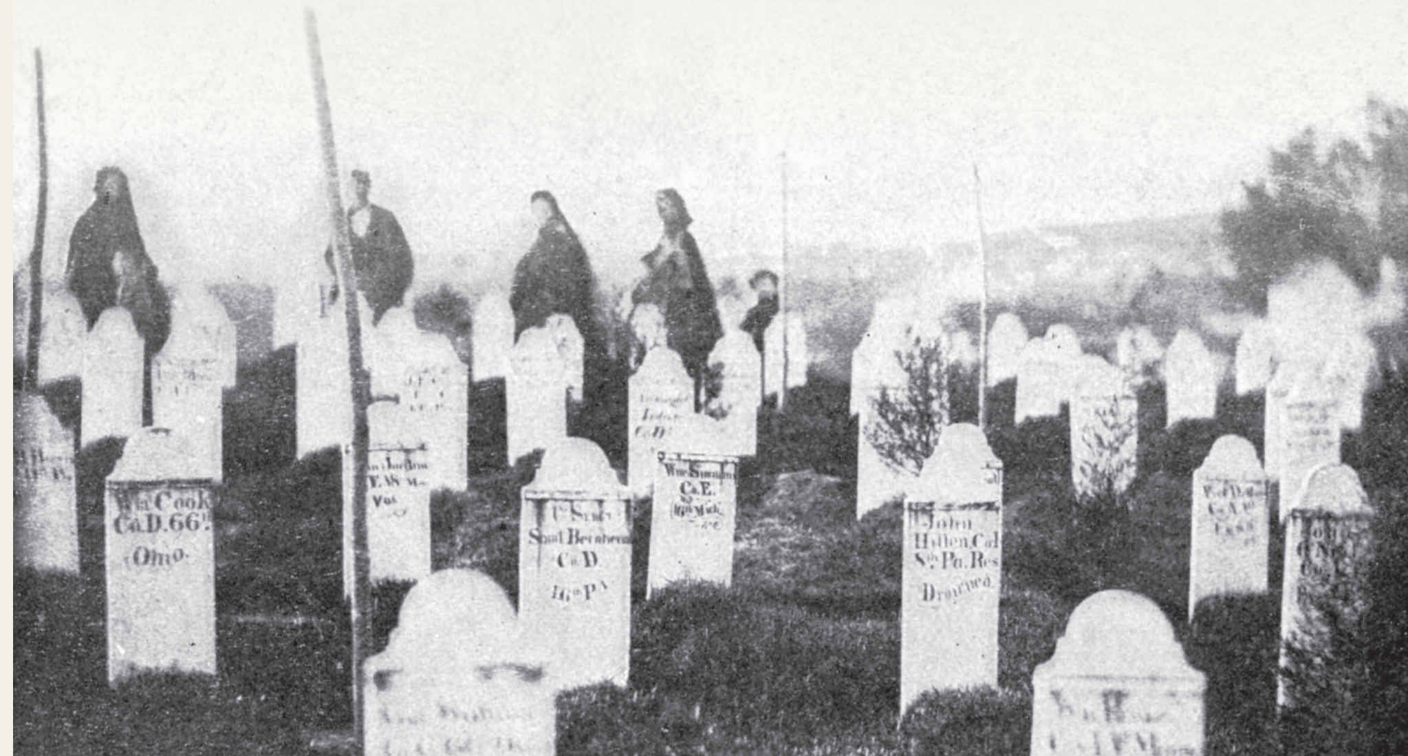
Mourners at Alexandria National Cemetery, Virginia, c. 1865. After 1873, standard marble headstones replaced the wood headboards seen here. Miller, Photographic History of the Civil War (1910).