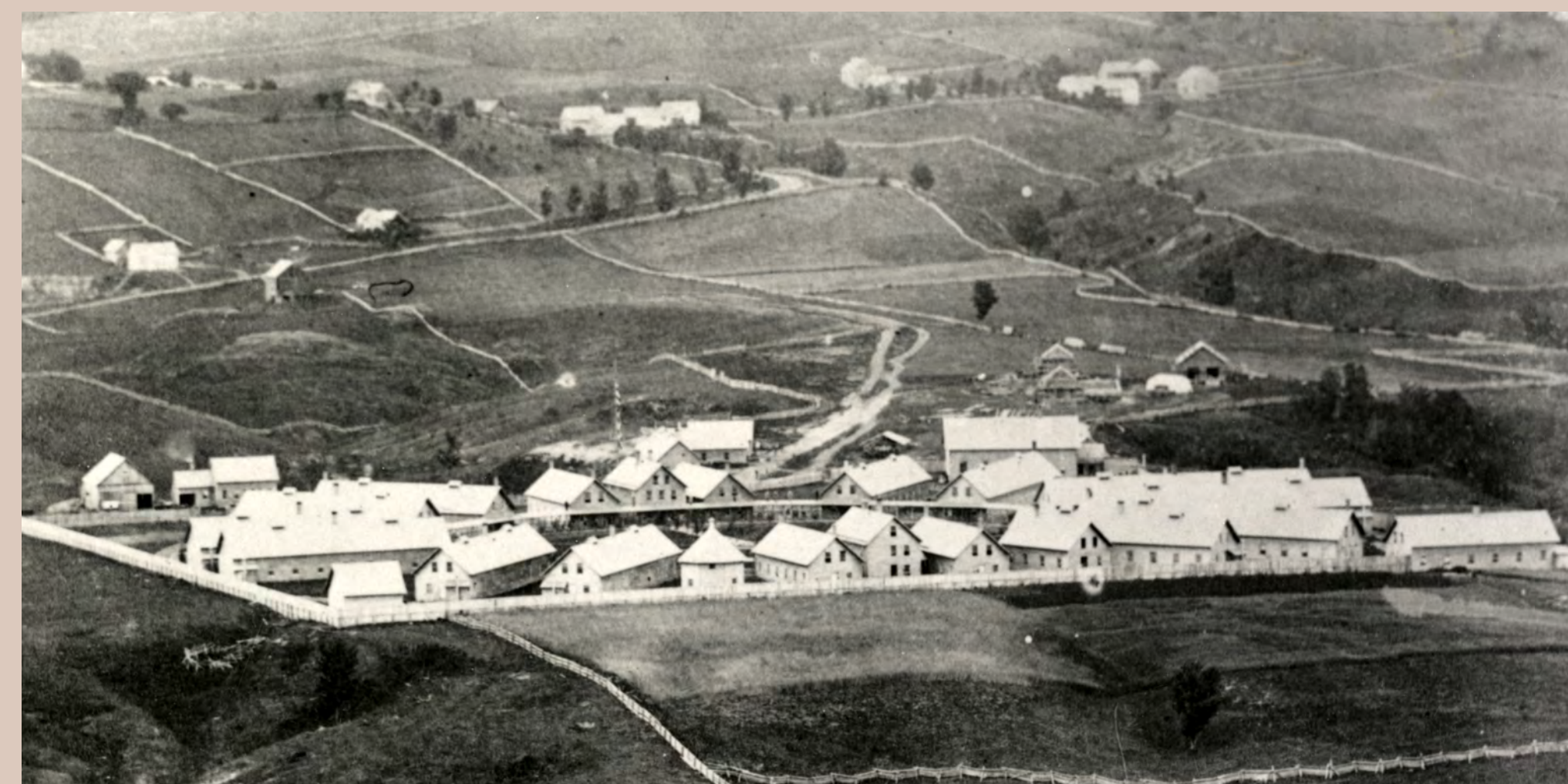
Sloan General Hospital, Montpelier, c. 1865.

During the Civil War, Vermont’s three general hospitals cared for 8,574 patients. Sloan closed in December 1865. In just more than eighteen months, 1,670 patients were treated here. Of the 174 who died, some were buried in town.