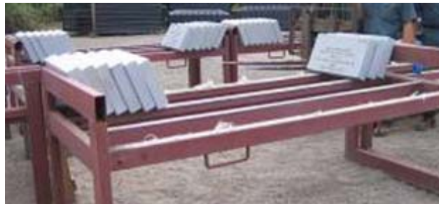
Flat markers stored correctly