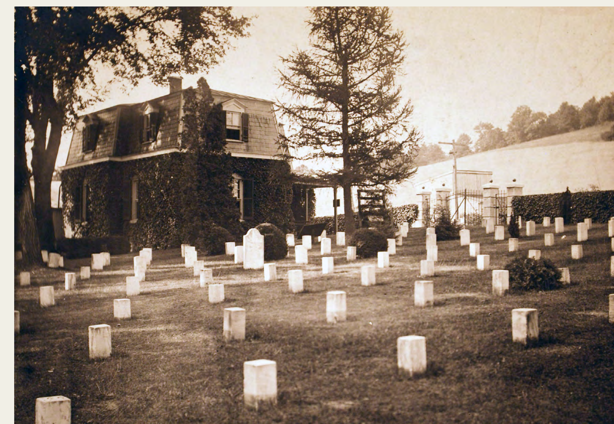
Lodge with unknown grave markers at Staunton National Cemetery, 1908.