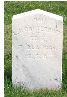
Historic headstone for which a “retro” version is being developed (see NOTE ).

NOTE: The “retro” headstone style is being developed for historic Prisoner of War-related cemeteries managed by NCA (e.g., Rock Island, Camp Chase).