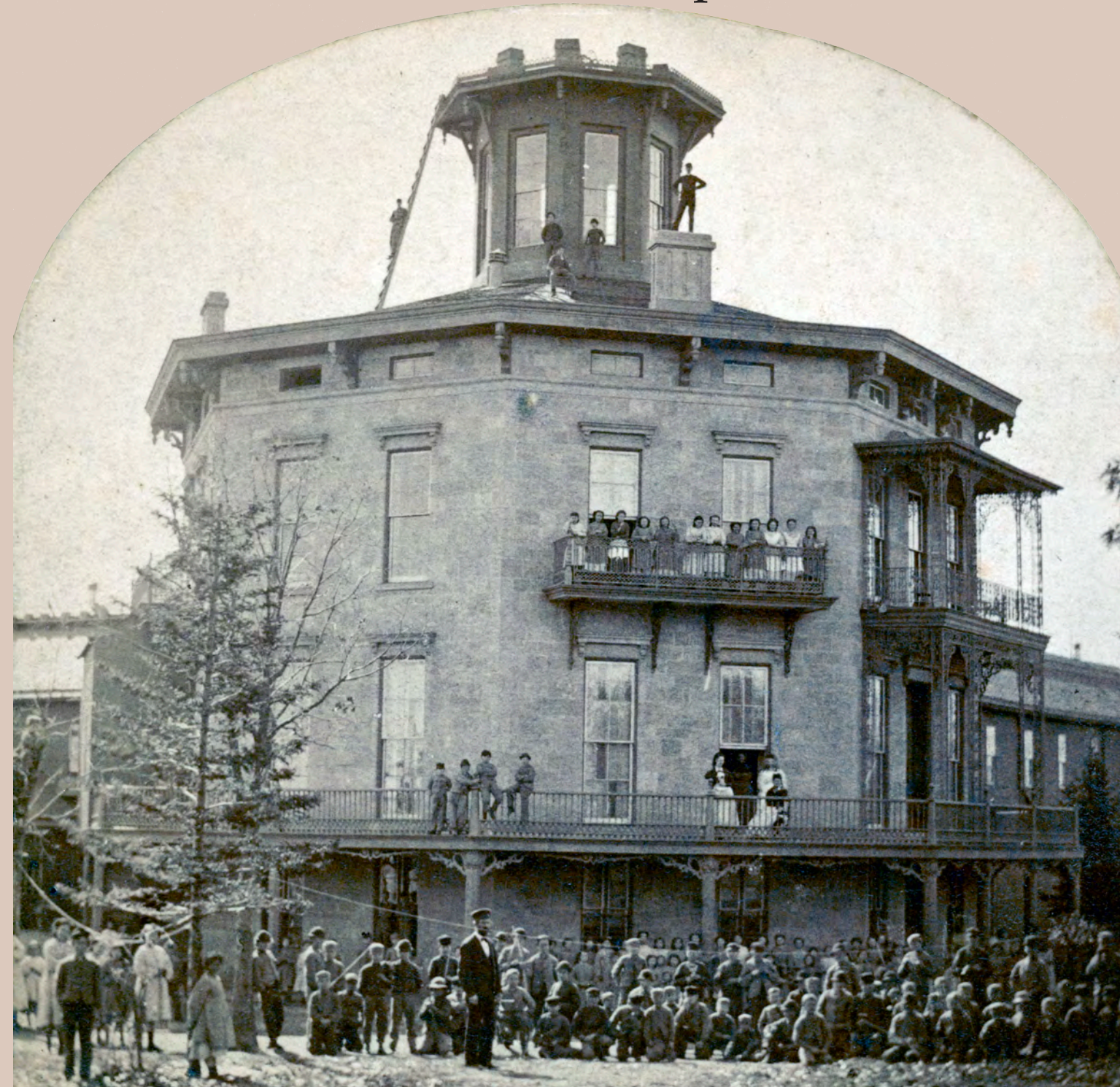
Orphans’ Home, 1870. It closed in 1874, after the last children had aged out of care.

She toured hospitals in the South and saw the appalling conditions soldiers endured. In 1863, she persuaded President Abraham Lincoln to establish a general hospital in Madison. Harvey U.S. General Hospital opened in a three-story octagonal house built for former Gov. Leonard Farwell. A branch hospital at nearby Camp Randall was also set up. In December 1864, the complex reported that it was treating 587 patients. After the war, the general hospital became the Wisconsin Soldiers’ Orphans’ Home.