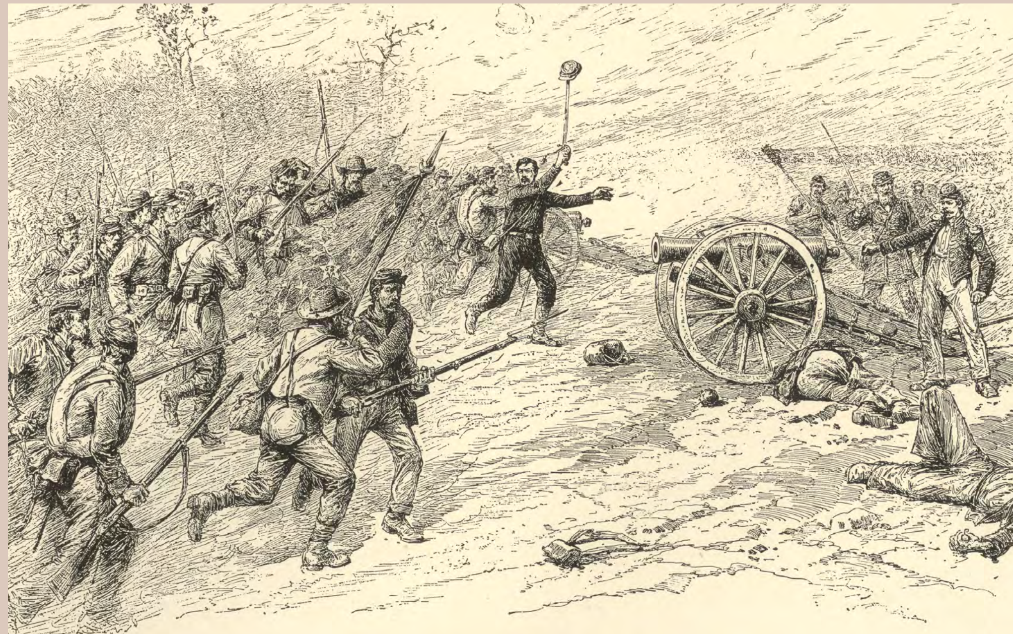
Battle of Glendale, also known as Frayser's Farm. The Century War Book, 1894.