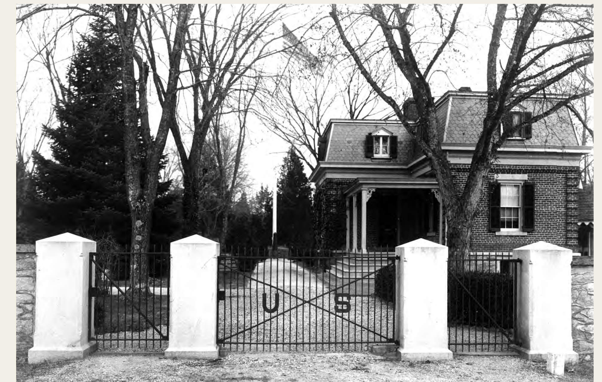
Cemetery entrance, 1904.